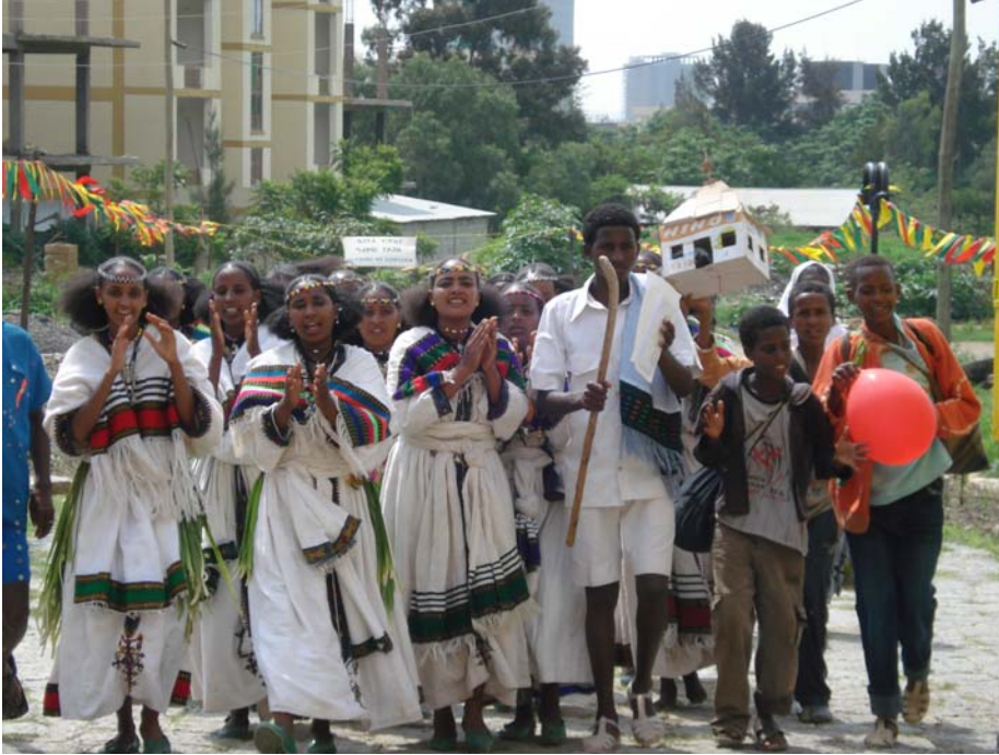
Photo 9. A group of Ashenda Girls (and boys) walked in from the town of Deбри to participate in the Ashenda festivities. This group won first place in a dancing/singing completion.