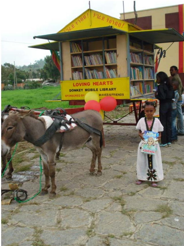
Photo 2. This Donkey Mobile Library was stationed at The Segenat during the dedication and attracted much attention.