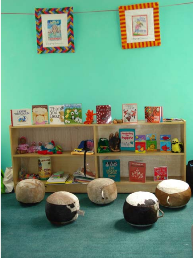
Photo 15. The alcove of the reading nook was the site of many arts and crafts activities. Locally made cowhide stools added additional seating and functionality. Two quilted wall hangings of Yohannes' books, Tirhas Celebrates Ashenda and Silly Mamo added whimsy to the décor.