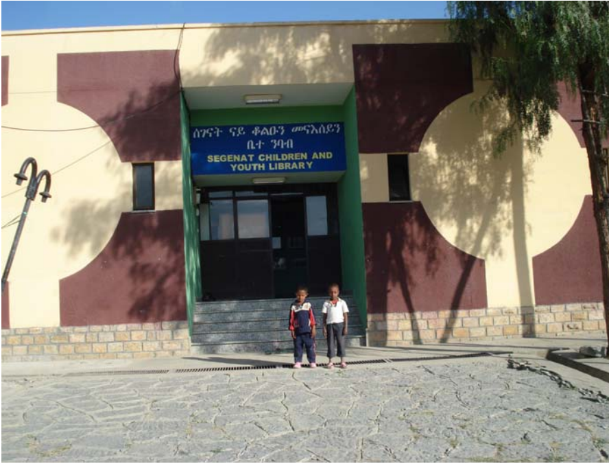
Photo 5. The Segenat Children and Youth Library is a free standing building that houses 20,000 books, a computer/media lab, small classrooms, and ample study space.